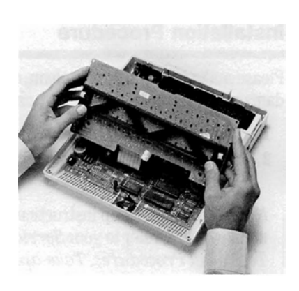
Figure 2. Flip Keyboard onto Disk Drive